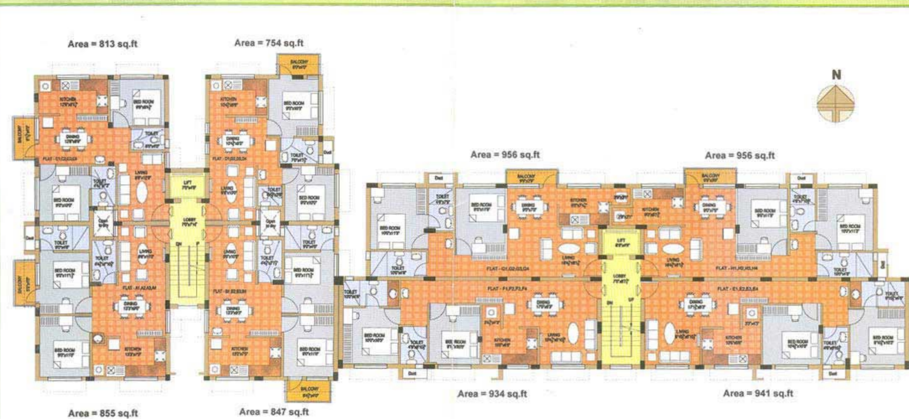
TYPICAL FLOOR PLAN (1st, 2nd, 3rd & 4th FLOORS)

COPCOHOMES has a firm commitment to meeting deadlines and with a dedicated workforce, ensures that your dream homes are delivered on time.